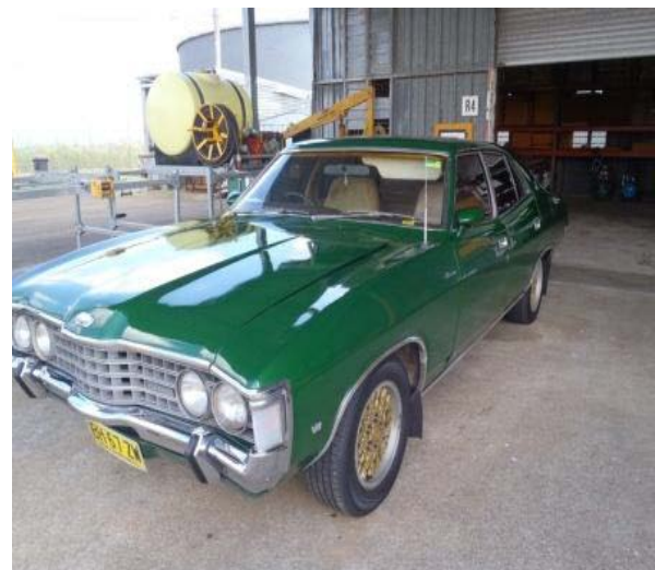
My new motorkhana car